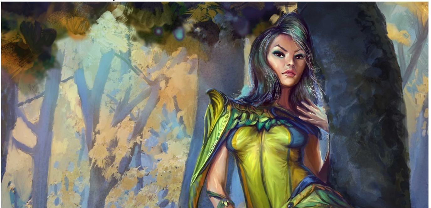
Ancients Rising. Winter Holiday Fiesta!: